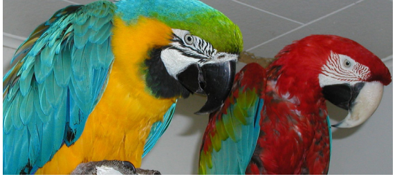
Mango and Calypso have bonded and are now inseparable. They even eat together from the same bowl.

Look for the links on our home page: peterboroughutilities.ca